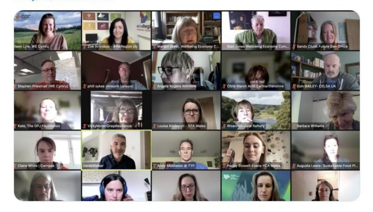
10:13 AM · May 18, 2023 · 1,050 Views

We've partnered with @WEAII_Alliance today to have an important conversation as part of Our Future Focus. Get involved: bit.ly/m/futureffocws