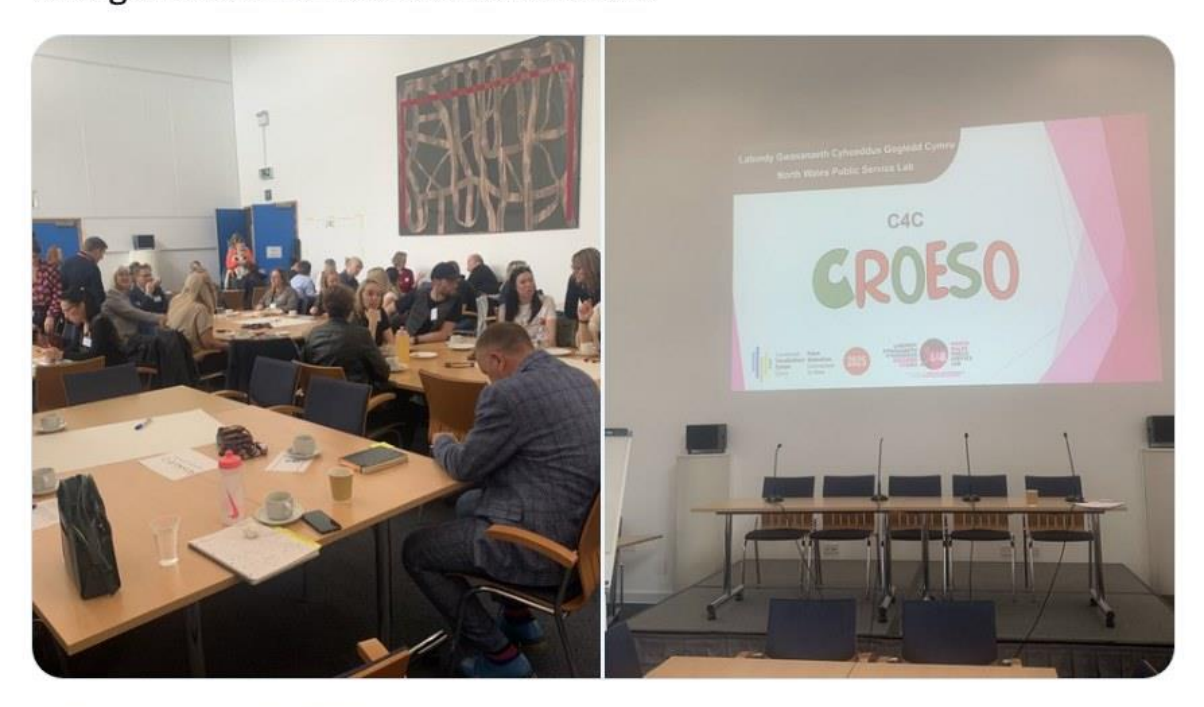
10:21 AM · May 10, 2023 · 693 Views

Brilliant turnout @theopticcentre for our @WGUCivicMission C4C launch in collaboration with @futuregencymru bringing together leaders and changemakers from across North Wales