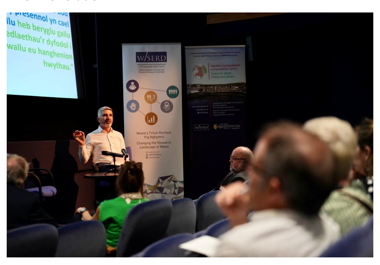
1 - Derek Walker, Future Generations Commissioner for Wales