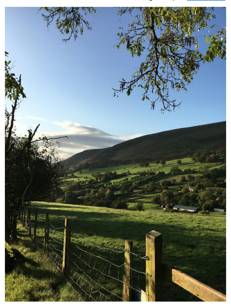
2 - <u>Wales Net Zero 2035 Challenge Group</u>

You can find out more about the Wales Net Zero 2035 Challenge Group on their website.