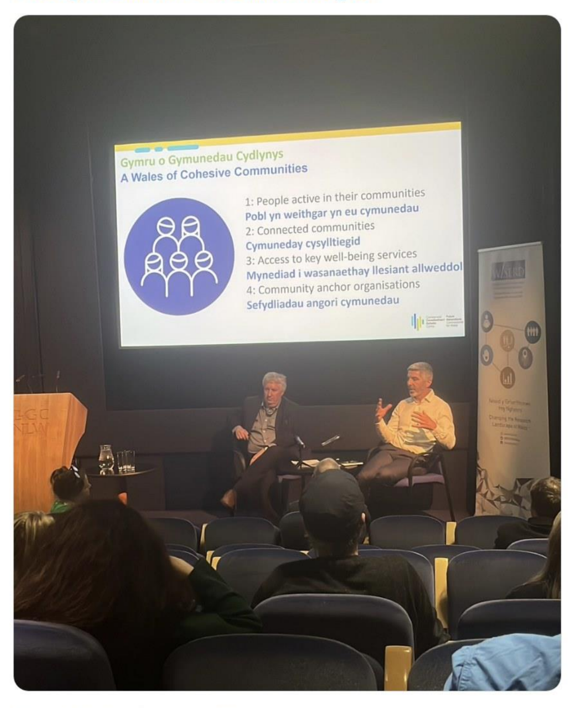
2:27 PM · May 24, 2023 · 1,898 Views