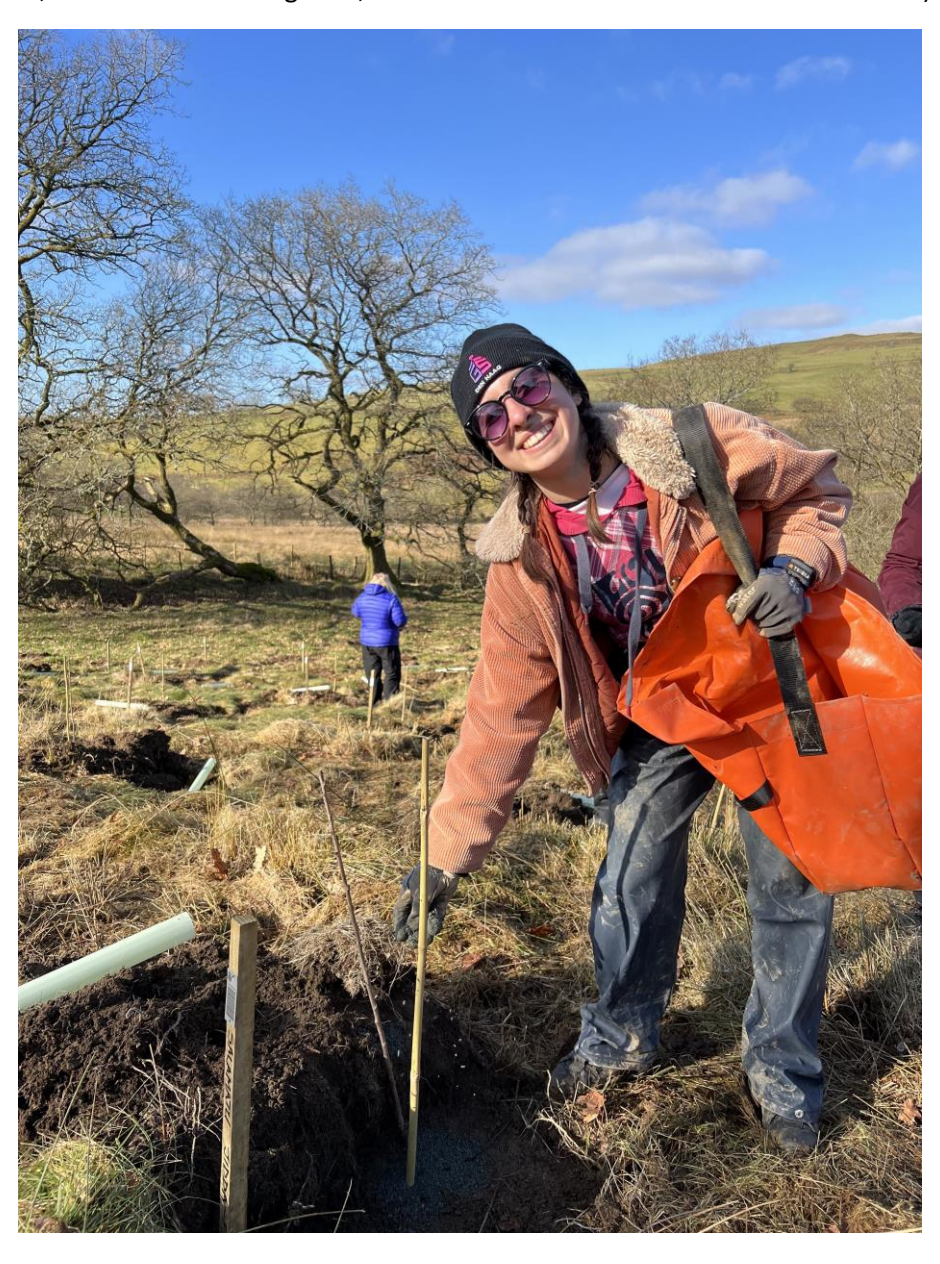
Wales Net Zero 2035 Challenge Group

Стихия (which, translated from Bulgarian, would mean an uncontrollable force of nature).