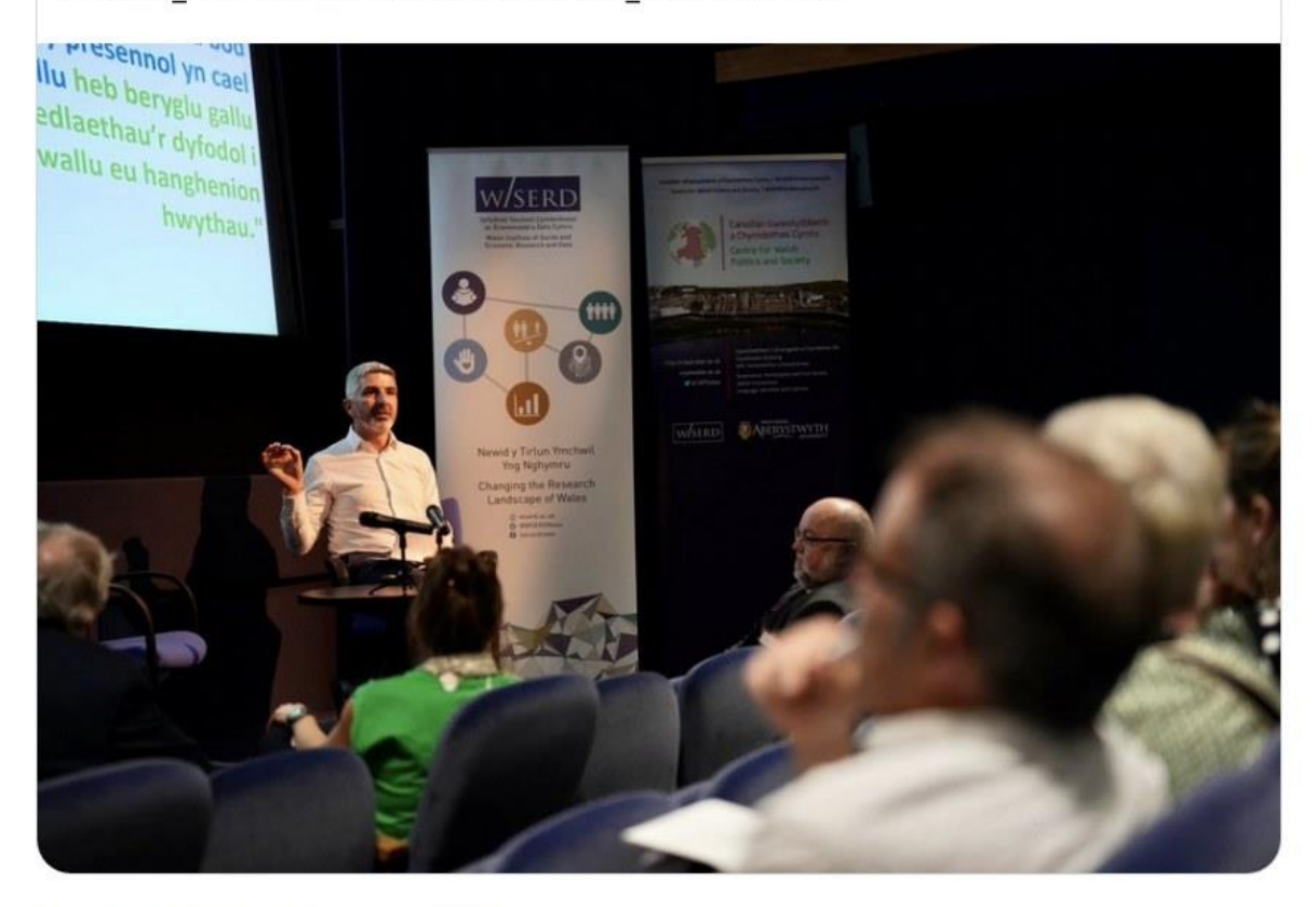
4:25 PM · May 24, 2023 · 622 Views

#VSSN_Aber @WISERDNews @VSSN_UK @AberRBI