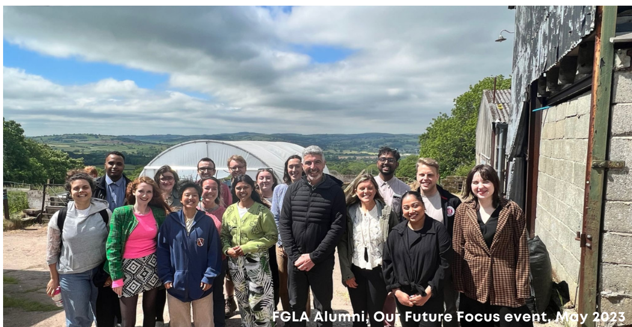
FGLA Alumni, Our Future Focus event, May 2023