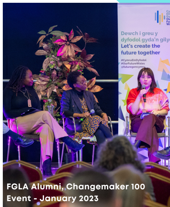
FGLA Alumni, Changemaker 100 Event - January 2023

For example if you are a carer, or are a disabled person we will cover any of the needs you might have to successfully apply and participate in the academy.