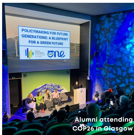
Alumni attending COP26 in Glasgow

Graduates of current and future academies will be invited to join the alumni network , and this network will grow each year, forming a key part of the movement for change for well-being and future generations in Wales.