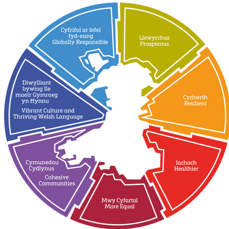
Figure 1: The seven well-being goals wheel

Wales is the only country in the world with a Well-being of Future Generations Act. It sets out seven well-being goals for Wales and five principles (ways of working) that help us all work together to improve our environment, our economy, our society, and our culture.