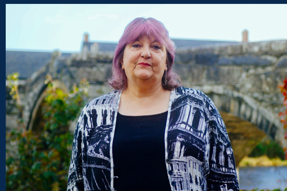
Meet the cast of Cymru Can