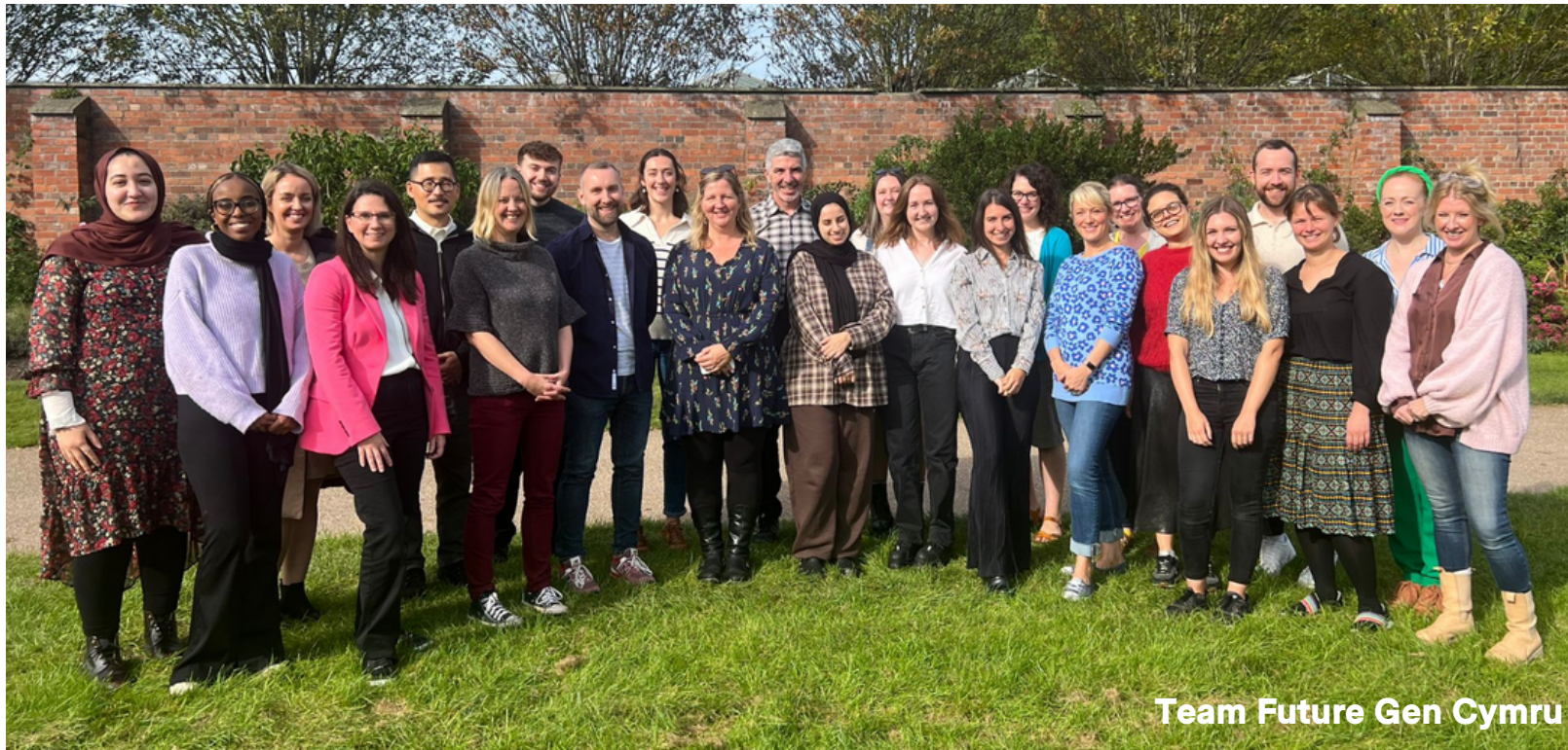
Team Future Gen Cymru