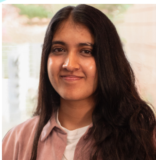
Masters graduate and research assistant Cardiff Council