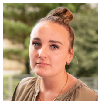
Local Authority Inspection Manager Care Inspectorate Wales