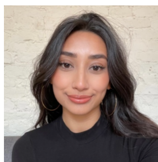
Project Coordinator TreeSisters