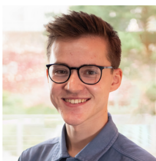
Executive Officer Cyngor Gwynedd