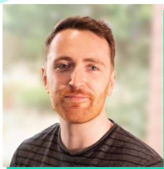
Head of Government Business (Economy) Welsh Government