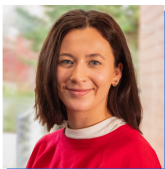
International Officer Urdd