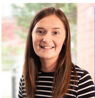
Manager Yr Atom (Welsh Centre in Carmarthen)