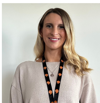
Digital Communications Officer Welsh Government