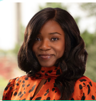
Project Support Officer Swansea City Council