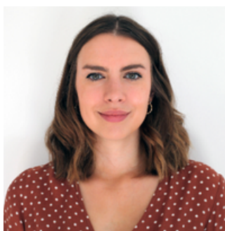
Communications Manager North & Mid Wales Trunk Road Agent