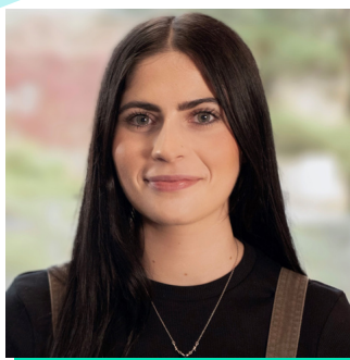
Executive Support Officer South Wales Police and Crime Commissioner's Office