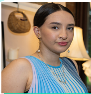
Textile designer, researcher and educator