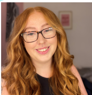
Leadership Development Manager Welsh Government