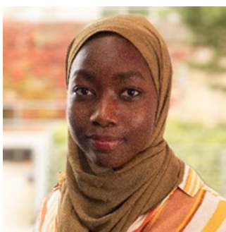
Policy Officer EYST

Yusra's hobbies include photography, art and reading. She enjoys reading fiction and poetry.