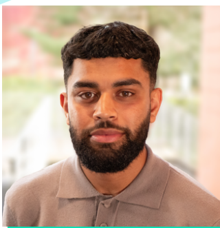
Presenter, Actor, Writer & Content Creator