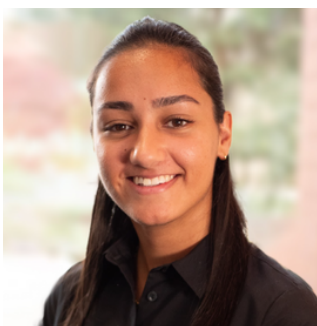
Football Services Executive Football Association of Wales