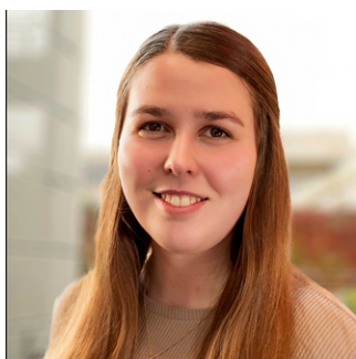
Specialist Advisor Natural Resources Wales