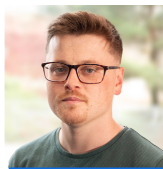
Deputy Bill Manager Welsh Government

He can usually be found drinking coffee, at the gym, and researching his family tree (though not necessarily at the same time).