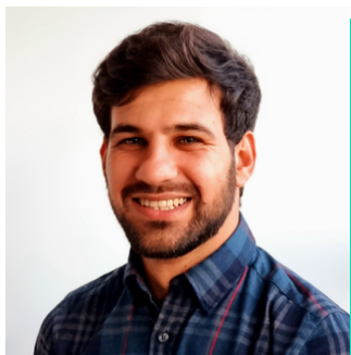
Website Designer and Digital Marketer