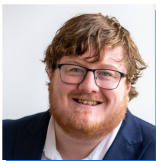
Policy, Research and Partnerships Senior Officer End Youth Homelessness Cymru

He is deeply passionate about the technology industry, especially the fascinating revolution of AI. He's also found a calling in helping others, particularly refugees and asylum seekers, and volunteers for the charity Oasis Cardiff. He likes to express himself creatively through painting, photography and writing articles and poems. In his free time, you'll often find him having a kick about with friends or playing for his team, Grange Albion.