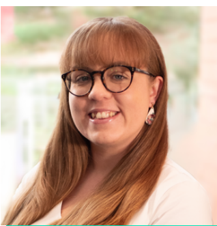
Senior Programmes Officer Stonewall