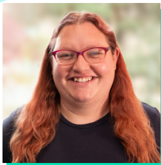
Business Change Manager Health Education and Improvement Wales (HEIW)