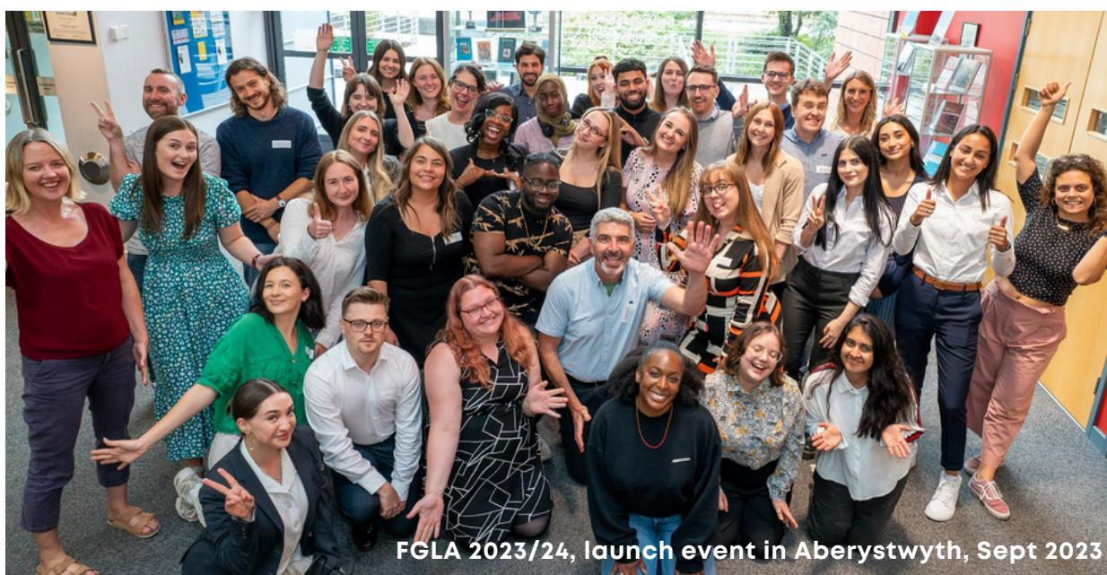
FGLA 2023/24, launch event in Aberystwyth, Sept 2023