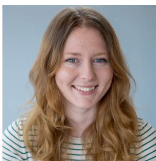
Product Manager Centre for Digital Public Services