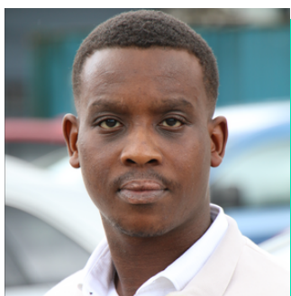
All-Wales Public Service Graduate South Wales Fire and Rescue Service and Hafod Housing Association