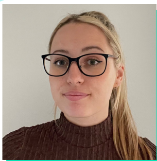
Assistant Operations Manager - NWAS Lead Betsi Cadwaladr, University Health Board