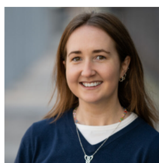
Team Support & Welsh Translation Administrator The Office of the Future Generations Commissioner for Wales

Outside of work she's started rowing and enjoys going to the pub.