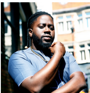
Producing Coordinator National Theatre Wales