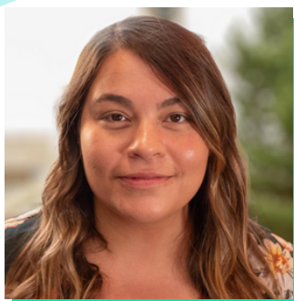
Customer Experience Team Principality Building Society