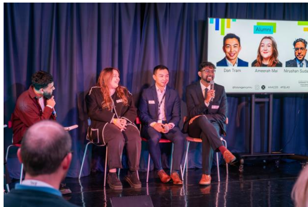
4 - Academy Alumni