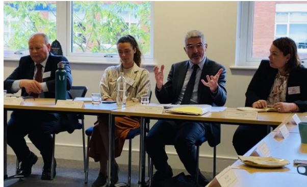
8 - Roundtable discussion with stakeholders from Morrisons, High Tide, the Crown Estate, Câr-y-Môr, the Waterloo Foundation and Sea Forest.

I also chaired a discussion on the potential of a properly managed seaweed industry with key stakeholders including The Earthshot Prize, Natural Resources Wales and The Crown Estate where we discussed how we can support this green industry through licensing and investment.