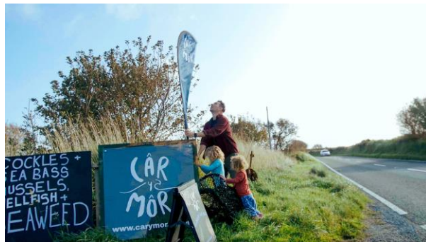
3 - Câr-y-Môr, a regenerative seaweed farm in Pembrokeshire.