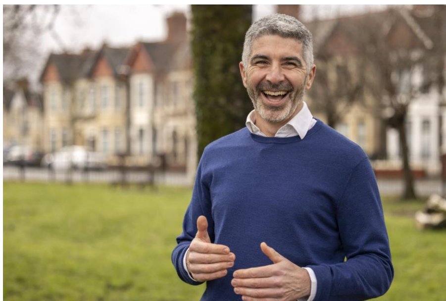
1 - Derek Walker, Future Generations Commissioner for Wales