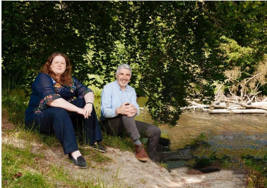
9 - Submit your evidence on water quality

You can submit evidence until Monday August 5, 2024, via their questionnaire or email IEPAW@gov.wales with the heading “Water quality evidence”.